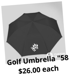
Golf Umbrella "58 $26.00 each

If you are interested please email westgatefundraisingchair@gmail.com listing what you are interested in so we can arrange payment.