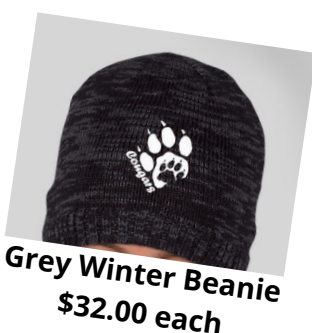
Grey Winter Beanie $32.00 each