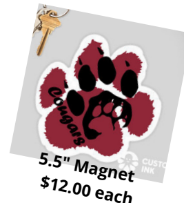
5.5" Magnet $12.00 each