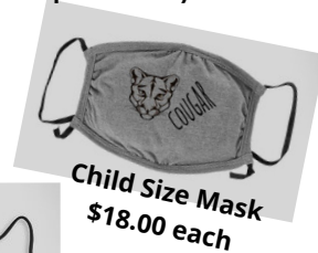
Child Size Mask $18.00 each