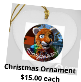
Christmas Ornament $15.00 each