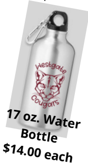
17 oz. Water Bottle $14.00 each