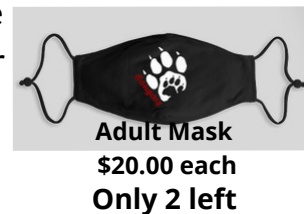
Adult Mask $20.00 each Only 2 left